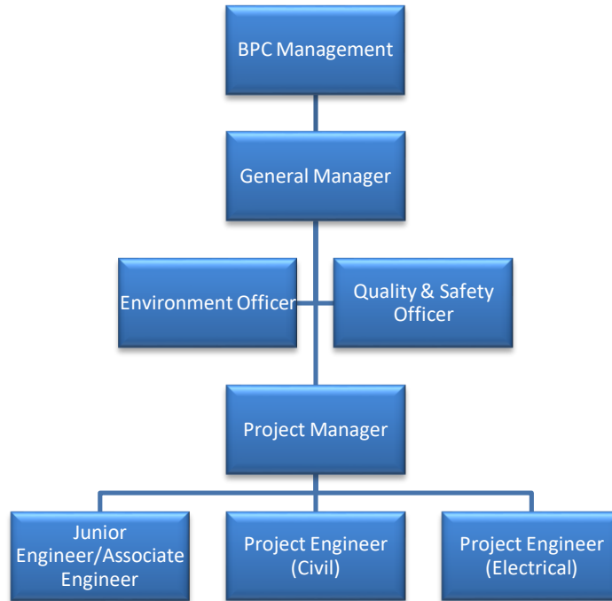
Figure 1: General Organogram of the Project Team